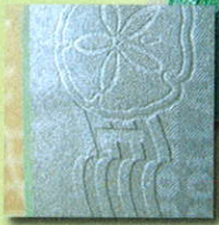
Sophisticated metallic feature