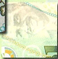
Watermark and denomination electrotype image