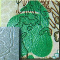
Green metallic patch