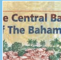
7. Gold Iridescent band