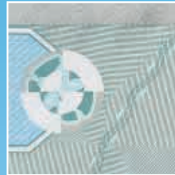
6. See-through feature