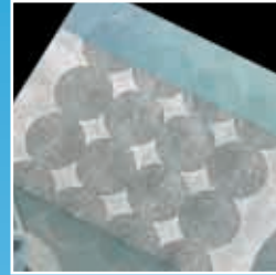
5. Metallic figure