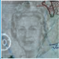
1. Watermark and highlighted image