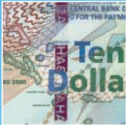
2. Colour shifting thread with text