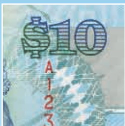
4. Large numeral with extra tactility